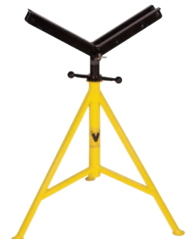
Basic Big V