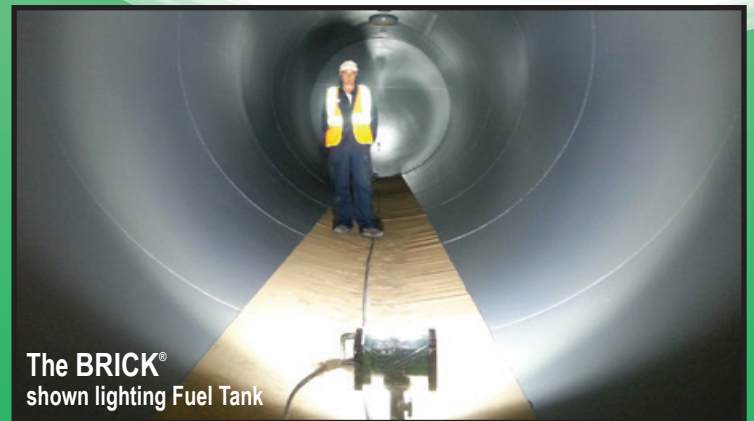
The BRICK ® shown lighting Fuel Tank