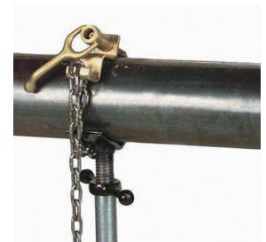
Hold Down Device (PN 781050)