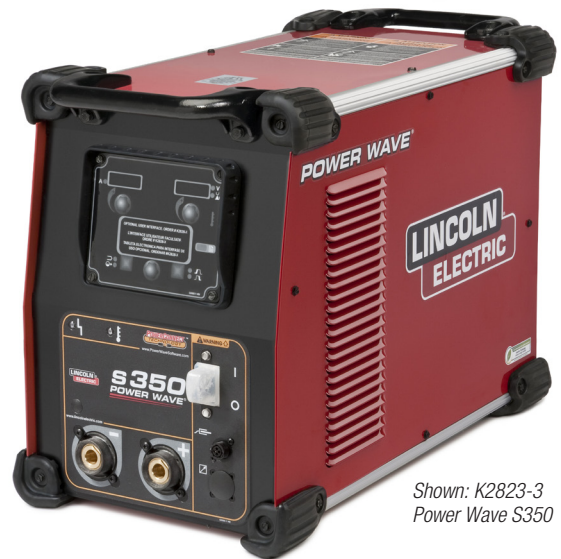
Shown: K2823-3 Power Wave S350