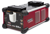
Shown: Cool Arc 55 S

Order K3086-1 for Cool Arc 55 Order K3086-2 for Cool Arc 55 S