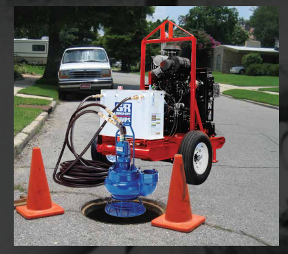
Hydraulic Submersible fits standard 24" manhole and passes a 5" solid