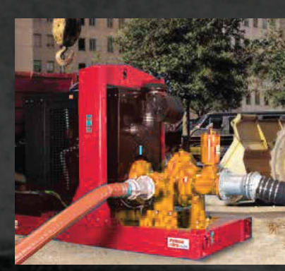
Sewage Bypass PAH Series high head pump

prime-assisted pumps with HDPE and galvanized steel Bauer pipe