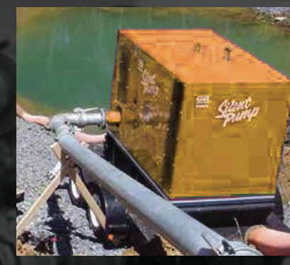
Municipality Compliant 70 dBa enclosed pumps for noise sensitive applications